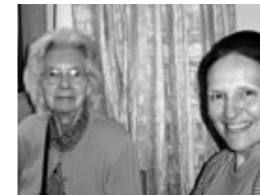
Visiting and befriending: part of our outreach Neighbourhood Care Project