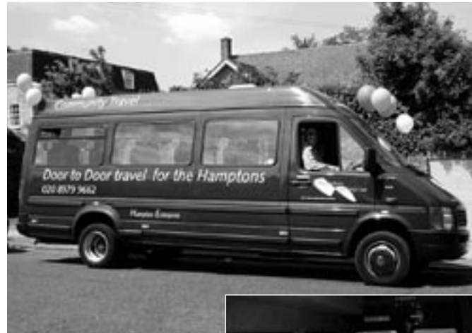
Hampton Enterprise Project provides door to door accessible transport